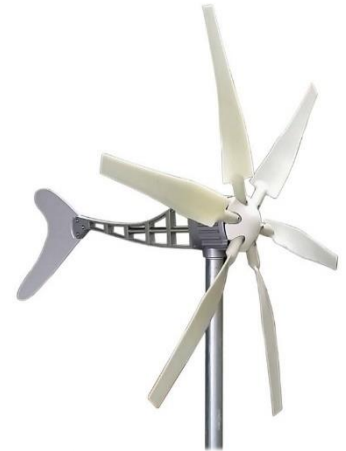
TPW-400DT 400W Wind Turbine