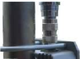
Complete installation kit is provided as standard part of the package. It makes installation fast, easy, and durable.