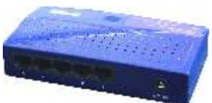
Optional PSW-205 PoE injector improves the connectivity by integrated 5 port switch.