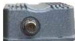
N-Female connector on GWA-627EX can be used for conection with high-gain directional antenna for long-range connection, or with omnidirectional antenna to setup cost effective durable access point