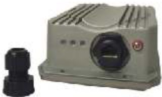
GWA-627VE/EX using industrial-grade LTW ethernet waterproof connector with IP68 specification. Functions of LEDs on bottom are configurable by firmware settings.

Unit is delivered with full set of accessories - complete installation kit, power-over-ethernet injector, power source and ethernet cable. Installation is fast and easy.