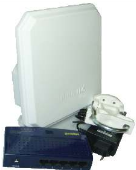
With optional PoE adapter PSW-205