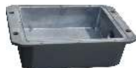
Durable die-cast aluminium enclosure provides 100% shielding against radio interferences and spurious signals from sides and back of the unit.

Connection to AP with hidden SSID granted